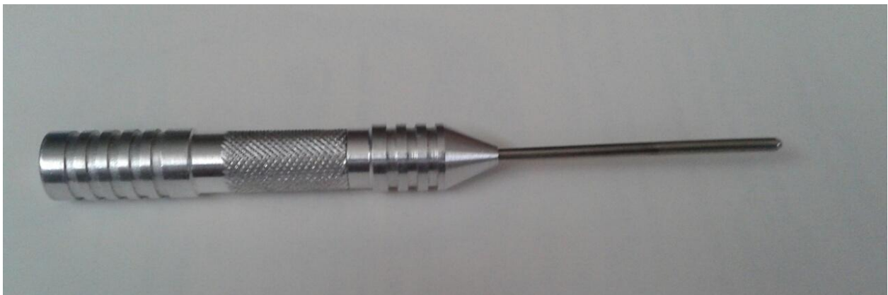
Figure 3, Teishin

Acupoints were treated with a teishin (Figure 3) instead of needles. The patient elected this option at the time of intake. The teishin is considered one of the 9 original Chinese medicine needles. The modern version used in this case has a 3-millimeter rounded tip which is lightly spring loaded to activate acupoints. The technique used for this patient was to place the tip of the teishin on the acupoint and use rapid alternating moderate pressing and releasing for a count of 30 seconds on each point. Use of the teishin is considered acupuncture. 14