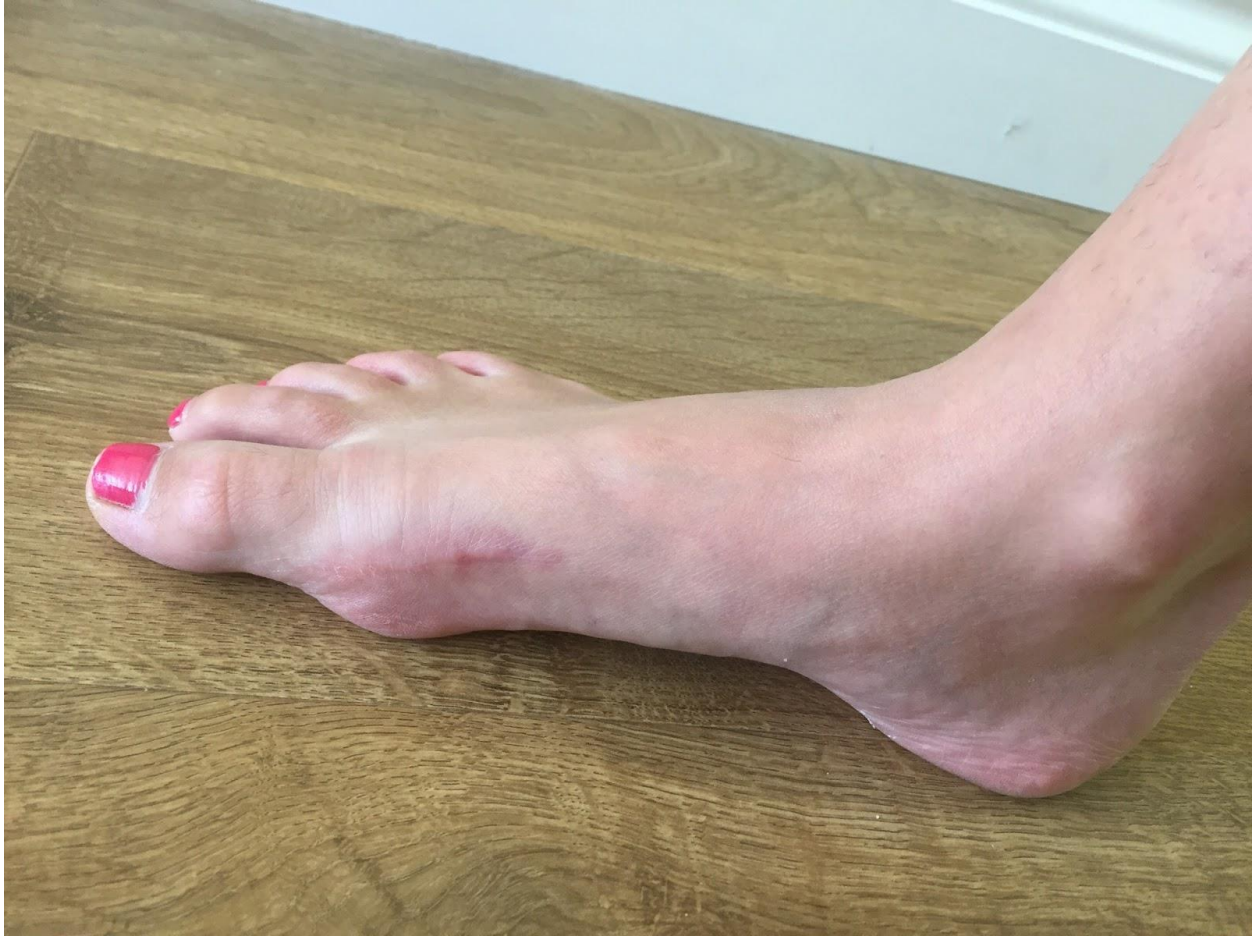
Figure 2, Bunion Surgery Scar

The picture above shows a typical scar left after bunion surgery. This scar is on the medial side of the right foot, and extends over the metatarsal across the joint to the proximal phalanx of the big toe. This scar is similar to the case study patient's scar.